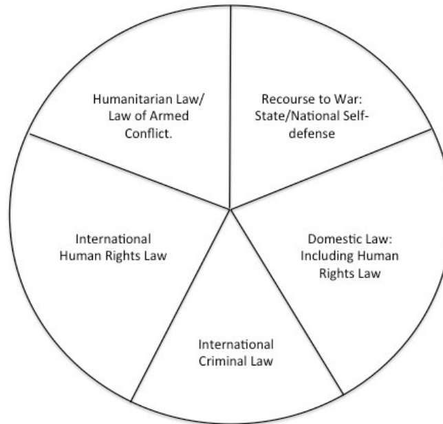
Figure 1.1 Applicable Legal Regimes

I have three preliminary points to frame this discussion. First, as you can note, I do not use the terms jus ad bellum or jus in bello to describe the law governing State self-defense, or international humanitarian law, respectively. Beyond its use by what sometimes appears to be an exclusive “guild” of international lawyers, Latin has had its day as a language of communication. Of course, a guild is defined as a “medieval association of craftsmen or merchants, often having considerable power.” 3 Latin is not the language of military commanders, politicians or the general public. The people we have to convince.