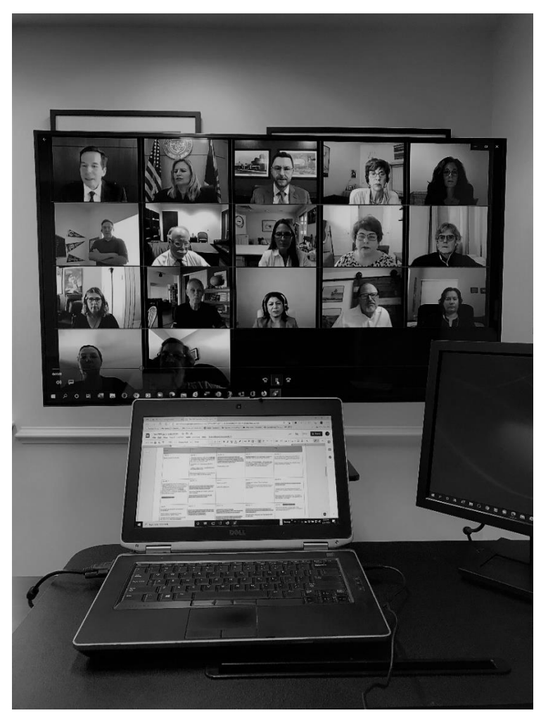
Fig. 3. Example of Big Screen Setup from Online Jury Selection Study, Maricopa County, Arizona (2021).