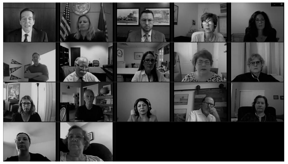
Fig. 1. Online Jury Selection Study, Maricopa County, Arizona (2021).

I. INTRODUCTION: JURY TRIALS DURING THE PANDEMIC