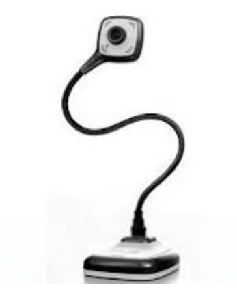
Fig. 3. HUE Camera from Amazon.

As jury trials continue remotely due to COVID-19 restrictions, the point is this: though there are obstacles to remote witness testimony, there are remedies to effectuate remote proceedings.