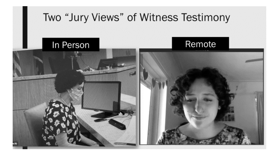
Fig. 1. Jury Views of Witness Testimony (2020).

One of the witnesses needed to convey tearful emotion while testifying. She appeared in the two modes to two separate mock juries: