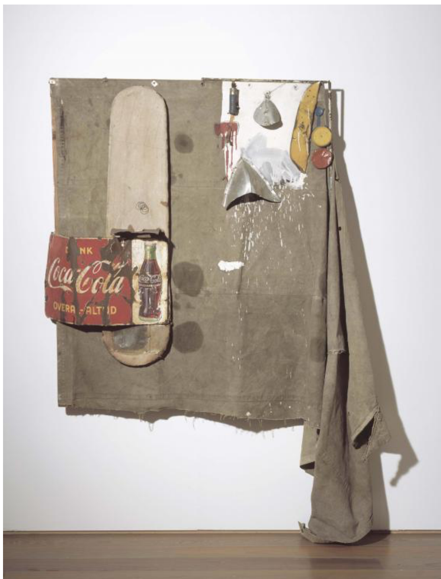
Fig. 7. Robert Rauschenberg, Dylaby (1962).

Dylaby , 101 Rauschenberg's 1962 contribution to the "dynamic labyrinth" exhibition by the New Realists at the Stedelijk Museum in 1962, 102 illustrates