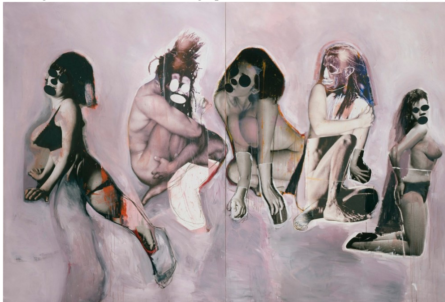
Fig. 4. Richard Prince, James Brown Disco Ball (2007).

Notably, the Cariou court distinguished transformative work from derivative work, stating that “[o]ur conclusion should not be taken to suggest, however, that any cosmetic changes to the photographs would necessarily