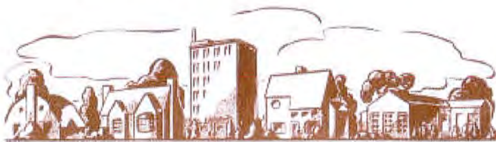
Figure 1. United States. Office of Price Administration, Rent Control Protects You. 1945. Poster, 21.5 x 28cm. Illinois State Library, Springfield, IL. From: Illinois State Library, http://www.idaillinois.org/cdm/ref/collection/isl5/id/158 (accessed June 7, 2018).

The Office of Price Administration and its successor agency, the Housing Expediter 13 , pursued rent control violations made known to them through tenant advocacy. 14 In 1944, a group of over thirty mothers and children, tenants of an apartment building on Sunset and Normandie, "stormed" the OPA office demanding protection from pending evictions. 15 In 1945, the OPA reported its "greatest single enforcement drive" in Southern California, prosecuting 117 landlords for failure to register properties as required by law. 16