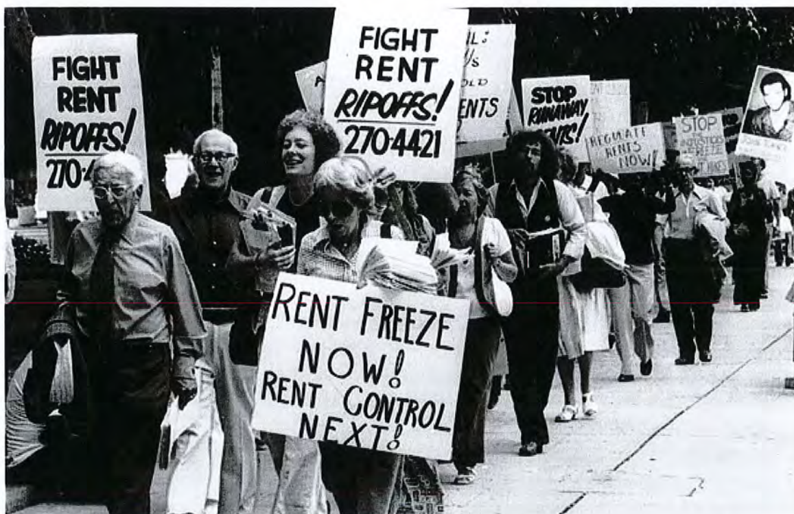
Figure 2. Renters march on Los Angeles City Hall, 1978.

Councilmembers led by Joel Wachs, who represented many of the neighborhoods affected by escalating rents, had already been advocating for some form of rent control for nearly a year. In mid-July 1978, the failure of many landlords to pass on property tax savings to tenants caused Mayor